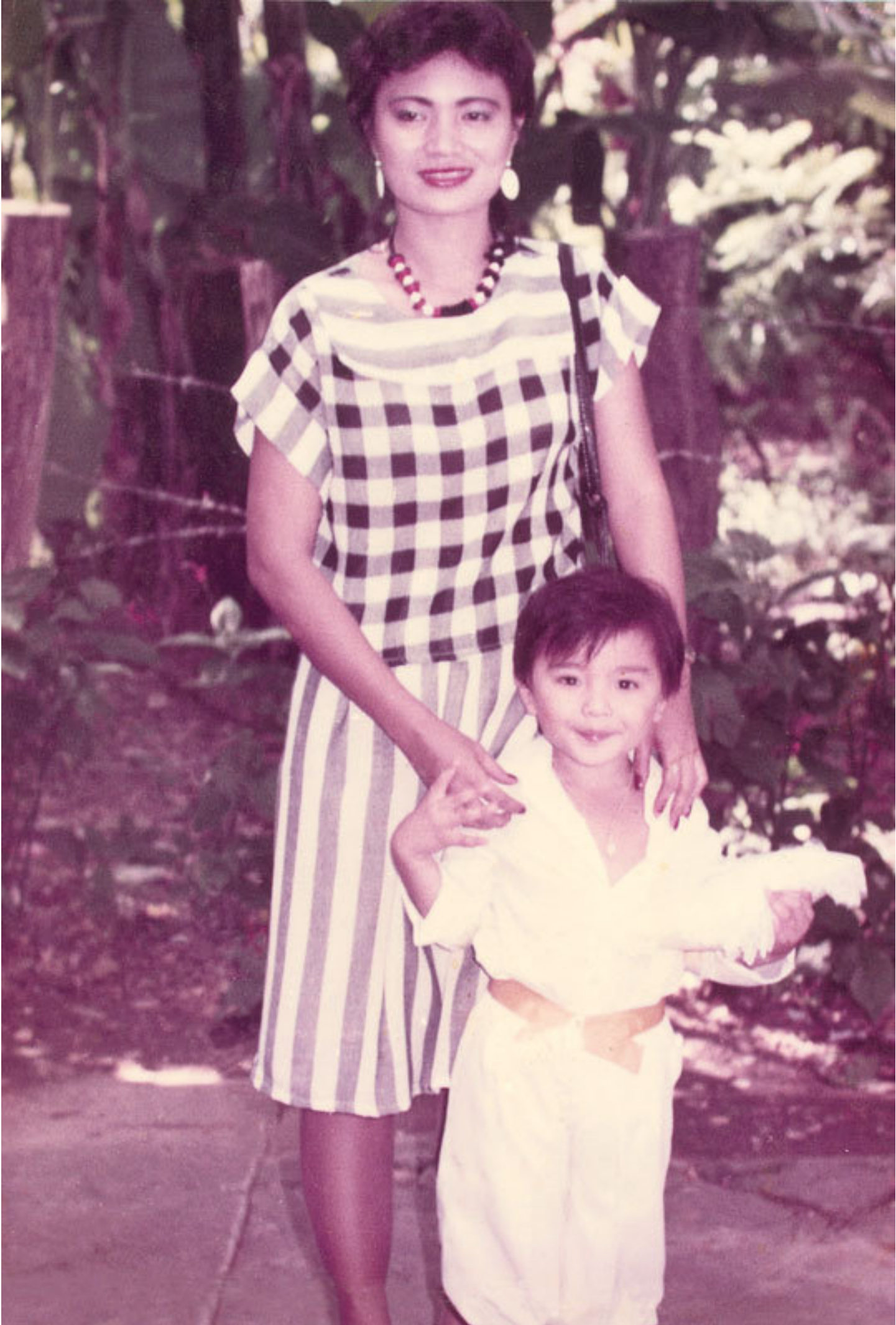
Pre-Flight In the Philippines with his mother, who was supposed to follow him to the United States but never did.

While my classmates awaited their college acceptance letters, I hoped to